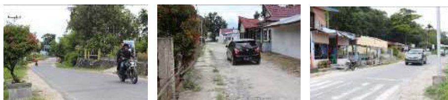
Figure 3. Access condition in study area

"This tourist area is quite easily accessed; a good road also makes my trips and family easier." (Main source: tourist).