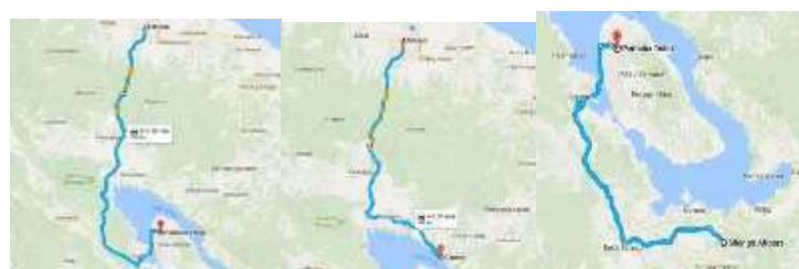
Figure 4. Access alternatives of study area

"To access Pantai Pasir Putih; there are three access point; tourists are free to choose which alternative they are going to use" (Main source: academics).