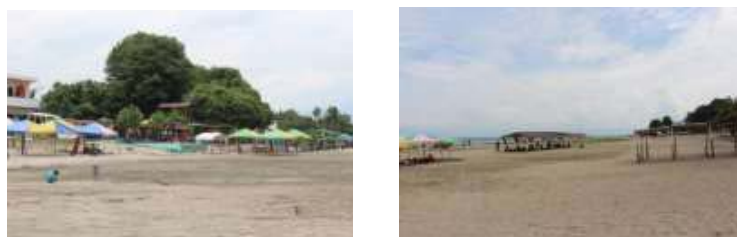
Figure 2. Current condition of Pantai Pasir Putih

"Conservation of the area is still very low; there is still a lot to do to improve its beauty. Local people still need to be fostered to maintain the beauty of the region." (Main source: academics).