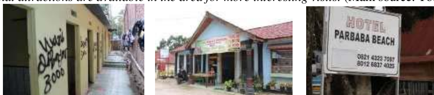
Figure 5. Supporting facilities in study area

"The information center in the region does not exist yet. There should be facilities that can notify visitors about what attractions are available in the area for more interesting visits." (Main source: Tourist).