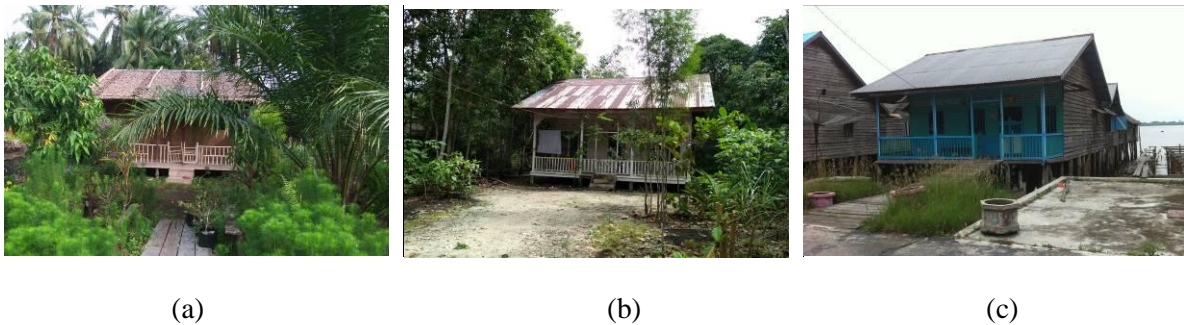
Figure 6. Akit Meranti house with leaves roof (a) wall board with zing (b) glass windows (c)

Akit house orientation, they called angin tua or face is to the south. Election the north related health factors. Akit said that the sunrise should be in the side of house. And if case of natural disasters in the sense of a village found disease, Akit people must move to new village. The house is not only a place to live, but also is a place of ritual life. There are three main ritual in Akit house. First ritual is 44 hari ritual as marriage ritual; second ritual is birth ritual they called cuci bidan ; third ritual is bedak limau as the process of death.