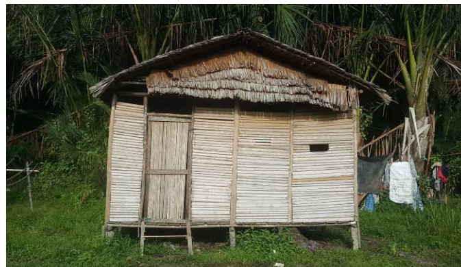
Figure 1. The native house of the wall midrib sago

The native house in Meranti islands is the stage house with wooden piles, roof made from the leaves, wall from the midrib sago, floor of wood or from midrib sago, and construction of the main wood with pegs (Figure 1). The existence of the house is assumed as the original and is difficult to prevail again. There are several houses in the village of Sesap that still have characterizes of the native tribes. The native house is consisting of living space, which serves as all space, the loose space not having the bulkhead. They limit itself in the house and is visible from grouping function, whereby on the front part for receiving guests, the middle part of the family room, and back part as the kitchen.