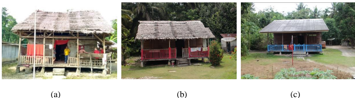
Figure 5. Rupert Akit house with leaves roof (a) wall board with leaves roof (b) wall board with zing (c)

Akit's house in Rupert islands (Figure 5) is built on piles. Interior of the house can be found in three main parts; umba as front space, main hall, and kitchen [3]. If we compare with Akit Meranti house form in Meranti (Figure 6), the same room division is amounted of three, but in has terms of slightly different naming. Selaso as umba-umba or front space, luang tengah as the living room, and luang dapu as kitchen.