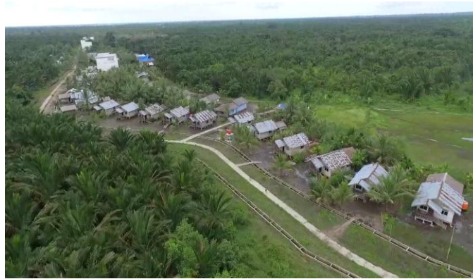
Figure 2. Tribesmen settlement with the sago plantation situation around