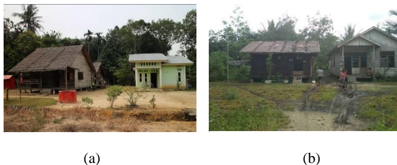
Figure 7. Government assistance house in Rupa 2015 (a) in Meranti 2008 (b)

Government service for isolated culture communities is by the presence of assistance programs of healthy house (Figure 7). In 2008 on Sesap village, government gave stage house. Stage house with wall board and zinc roof become the new house for Akit people. New technology and material are affecting to way of life and occupancy the Akit. In rupa island on 2015 procurement healthy simple house from government. From one side, it is good things for Akit community, but from another side, the design of a healthy simple house is consider inappropriate to tradition and habits of the Akit.