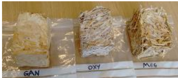
Figure 2. Three Specimens.