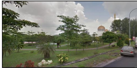
Figure 3. No Barrier around the Study Area

The observation analysis shows that the environmental aspect of the study area is not safe for the public to engage in the recreational activities. This is because the area did not have strong element of territoriality to aid the local community to defend their neighborhood park against crime. In fact, the area is exposed to crime activities particularly snatch theft due to no physical barriers provided between the recreational area and non-recreational area. Thus, it creates a weak territoriality of Taman Tasik Puchong Perdana. Physical barrier can be designed and provide in the form of landscaping or fencing which can control the entrance and exit of the area.