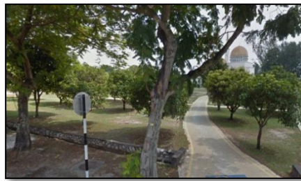
Figure 4. Landscape in the study Area

The children's playground is also located out of sight and do not have barrier around it which can lead to the crime activities such as kidnapping. Moreover, the image of this neighborhood park do not have sense of welcoming that can attract the public to engage with the recreation activities. Milieu is also one of the defensible space variables that is related to the design and placement of buildings surrounding the study area which can create an area prone to crime. Moreover, part of the neighborhood park is visible from the main road and can be accessed directly without proper barricade, which is at Jalan Persimpangan Puchong Perdana. Thus, this shows that the element of milieu is not fully applied in this neighborhood park.