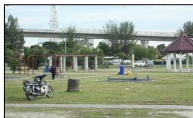
Figure 2. Condition of

The first variable observed is the condition and provision of facilities in the neighborhood park. From the observation, the provision of facilities still did not fulfill the characteristics and requirements for the planning of neighborhood park as shown in Table 1. This is due to the lack of provision of facilities such as football field, badminton court, takraw court and futsal court in the study area.