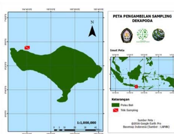
Figure 1. Sampling location.

The study was conducted in June 2016 at Pemuteran, Bali (Figure 1). Two dead coral from Pocillopora sp. were collected from the depth of 8 – 12 m. Dead coral with a size of a head were bagged and gently broken by its base with a hammer and a chisel to separate it from the coral reef, and quickly placed in a 20-liter bucket underwater.