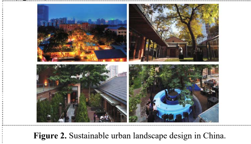
Figure 2. Sustainable urban landscape design in China.

materials on the site, maximizing the potential of materials to reduce production, processing and transport of materials and reduce construction waste, and retain some characteristics of local traditional culture (figure 2).