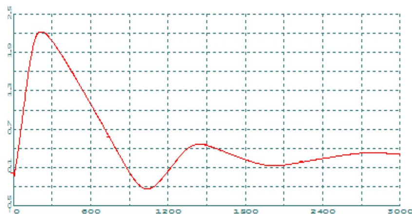
Figure 2 The operating frequency curve of Gongshan area

According to the relevant provisions of the network, and the provincial company ,here only to discuss the independent network instability, surplus power ,transmission channel failure two cases. Nujiang power grid belongs to the municipal power grid, Gongshan, Fugong and Lanping power supply load belongs to the residents load and industrial load, no significant load, so the resulting accident event level is highest for the secondary event.