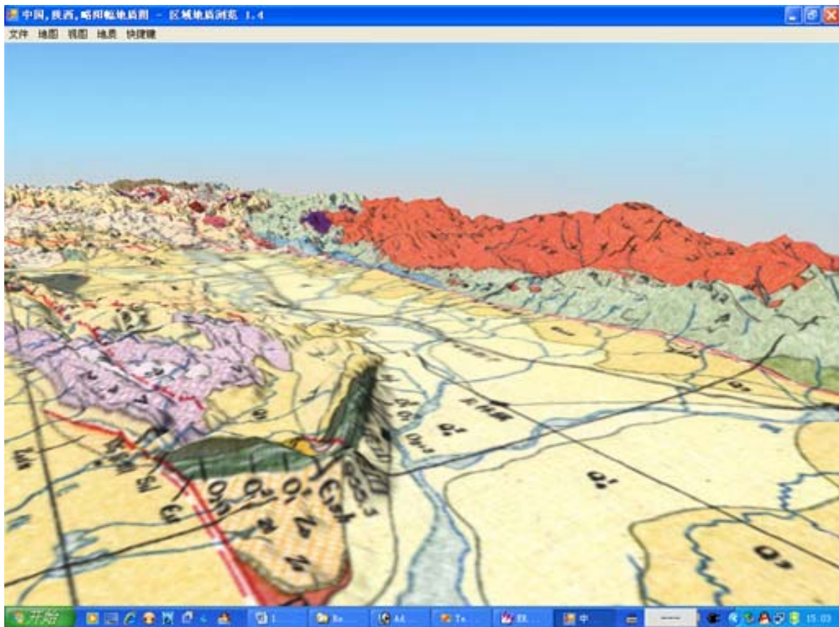
Figure 2. Three dimensional geological map demonstration

The produced three dimensional geological map system interfaces is showed in figure 2. In this system, user can roam, rotate the scenes with mouse or keyboard and inspect the regional geology content. Carry out the structural analysis combined with the three dimensional terrain. And also can examining the strata synthetical histogram, map section and legend at any moment (figure.3).