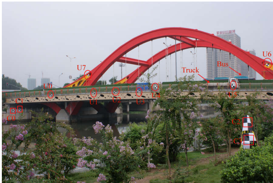
Figure 2. Illustrte of bridge test

Figure 2 shows that Fenghuangshan road bridge is a self-balanced reinforced concrete, central bearing frame arch. It is of beautiful appearance and it takes good use of the material properties and mechanical properties of the concrete structure. It is 31.5-meters wide. Its span is 18+60+18 meters. The main arch is steel tube concrete, which is the most important compression member. The bridge panel consists of precast concrete and cast-in-place concrete. The arch concrete structure is a large volume concrete.