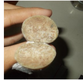
Figure 1. One of incubated sample

* all samples have passed the acidity test