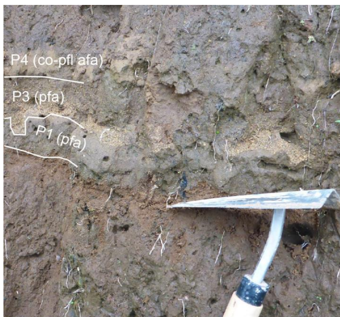
Figure 6. Occurrence of the Samalas tephra (1257 A.D.) on the southeastern slope of the Pohen volcano (Location 7).

Ashfall layers from the Samalas volcano eruption (1257 A.D.) on the island of Lombok (figure 6) [5, 6, 7, 8] and the Penelokan tephra are useful in establishing the tephra stratigraphy around this caldera. The Penelokan tephra corresponds to the Blingkan ignimbrite at ca. 5.5 kBP [9]. At the foot of the post-caldera volcanoes, coarse scoria falls [10, 11] are intercalated with two foreign tephtras (figure 2).