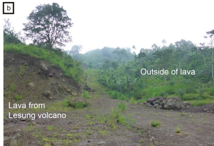
Figure 4. Lava flow and scoria falls on the western slope (Location 2) of the Buyan–Bratan caldera. (a) Four coarse-grained scoria falls above the lava flow. The scale of the lava is 1 m. (b) Penelokan tephra, which erupted from the Batur caldera (ca. 5.5 kBP), is distributed only outside of the lava.