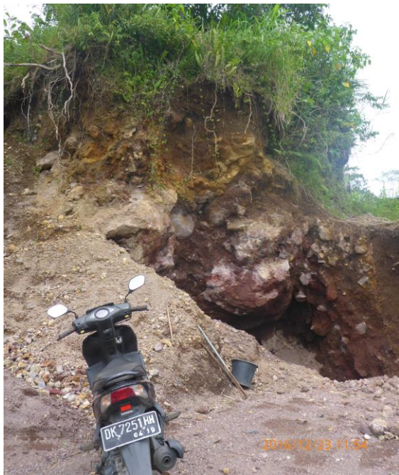
Figure 5. Outcrop of a debris avalanche deposit on the southeastern slope of the Adeng volcano (Location 8).