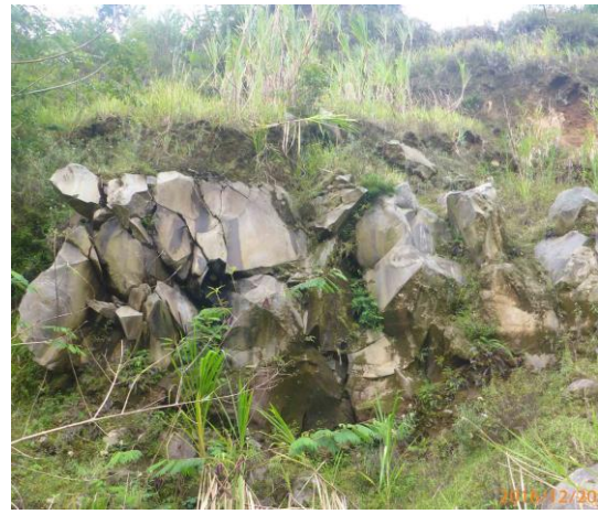
Figure 3. Outcrop of lower lava flow on the northern slope of the Tapak volcano (Location 3). The stratigraphic position of this lava remains unclear.