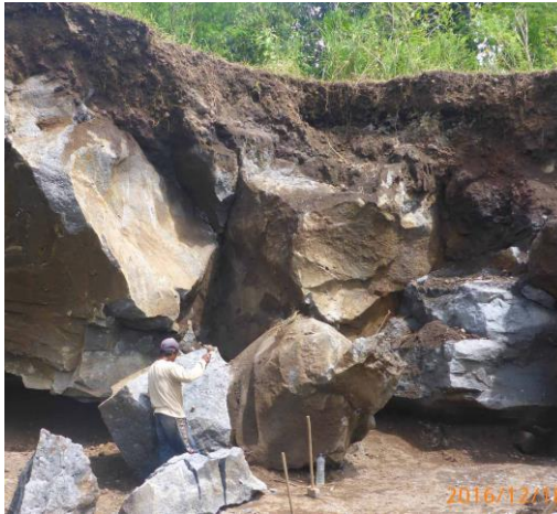
Figure 2. An occurrence of the youngest lava flow on the southern foot of the Adeng volcano (Location 1). Only the Samalas ash (1257 A.D.) covers this lava.