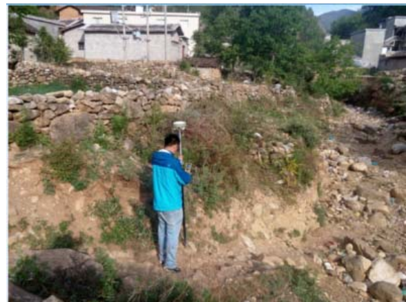
Figure 3. River landscape of Zuojiao.