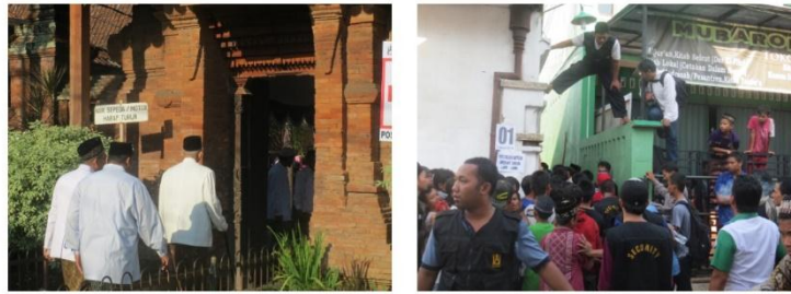
Figure 3. Religious Activities in Kudus Kulon