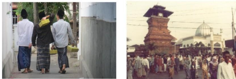
Figure 2. Religious Activities in Kudus Kulon

Religious activities of Kudus Kulon society dominate daily life includes daily, weekly, and annual activities. Women often held their daily worship activity in their homes. Although not a necessity, it is more commonly done in the Dalem room, the main and deepest chamber of the traditional Kudus house, while the men took a pray in congregation in Langgar (small mosque) in addition to the greater virtue and also the opportunity to meet neighbors and surrounding communities. Religious atmosphere in Langgar is felt especially during the Shubuh, Maghrib and Isha. Shalat is continued with dhikr or reading the Qur'an. At certain moments also held berjanjen (journey). People who come to langgar are not only the men surrounding but also santri (Islamic boarding school students).