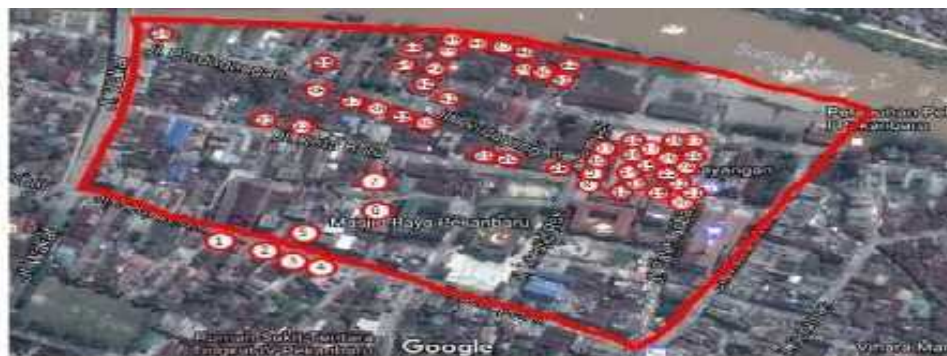
Figure 1. The guidelines limit the area at Kelurahan Bandar Senapelan.