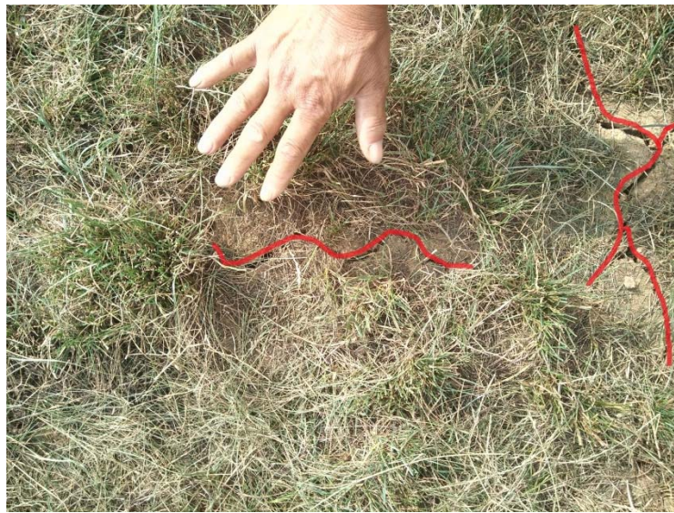
Figure 1. The surface structural morphology of cracks in loess cover

Figure 2 and Figure 3 illustrate the volumetric water content distribution in the loess landfill cover and the \text{CH}_4 emissions of 9 test points, respectively. The volumetric water content (VWC) in loess cover varied greatly in different seasons, and the VWC in summer was much lower than that in winter because of evapotranspiration (Figure 2). As a consequence, there were a number of desiccation cracks in the loess landfill cover in summer, while few cracks came into being in winter. As shown in Figure 3, the methane emissions from the loess landfill cover in summer were higher than that in winter. This was mainly due to the negative correlation between the gas permeability and the water content in the loess cover. In addition, the methane emission at test point 6 was much higher than the results of other test points, indicating the existence of preferential flow. Furthermore, as a result of the desiccation cracking of the loess cover, the methane emissions at test points 1, 6 and 8 increased significantly with the decrease of VWC in loess cover.