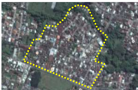
Figure 1. Watugong Kampong in Tlogomas, 7°56'20.0"S 112°35'51.1"E

Data is divided into primary and secondary data. The primary data of the physical data location (photo, measuring results and sketches), data from interviews with officers and supervising field space, and location mapping. The data obtained from field observations with camera tools, stationery, recorder and GPS. The usefulness of data for qualitative analysis in the form of the potential and constraints of the site, analysis functions and needs, as well as analysis of the object. Secondary data from literature on the potential and constraints Watugong village derived from the data Tlogomas village. The location selected in the village Watugong because it has the potential of local wisdom undeveloped and can be projected to the village for future travel. Here the object of study is presented in the map (googlemaps search: 7 ° 56'20.0 "S 112 ° 35'51.1" E) and photos.