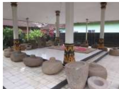
Figure 2. Watugong archaeological site (it called pendopo) contains stones like traditional music instrument (gamelan/gong)