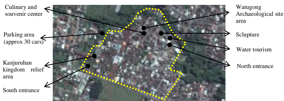
Figure 6. important location in site