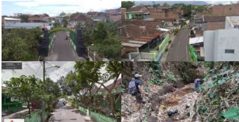
Figure 3. Existing condition at Kampong Watugong toward archaeological site area

the focus of this research is the landscape planning of road corridors by considering the history of both hardscape and softscape elements. Here is a photo existing conditions as explanatory.