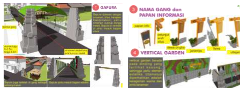
Figure 7. Form concept

Form follow the concept of history on the site, by using unique Kanjuruhan kingdom ornaments with jasmine buds characteristic or Kalamakara, the same form of the Candi Jago, Singosari and Candi Jago. Gong and the motives leaves the higher the conical worship Hyang Mring Waseso.