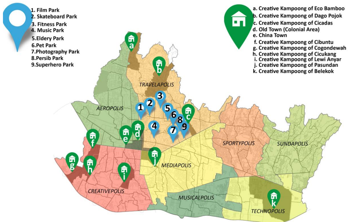
Figure 2. Inventories of Orgware and Creative Hardware Landscape in Bandung