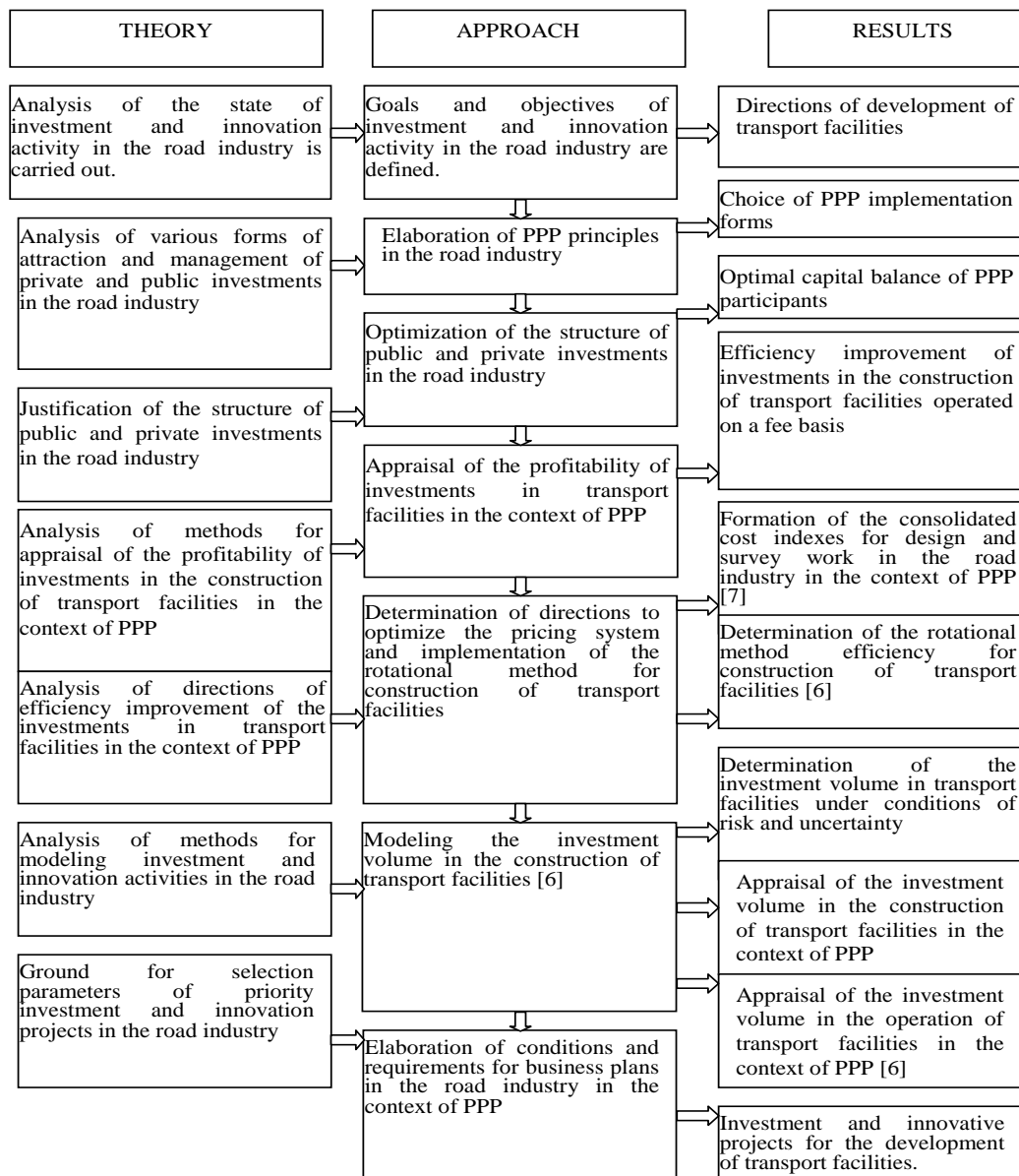
Figure 1. Conceptual framework for modeling of the innovation and investment activity in road industry in the context of PPP.

Implementing investment projects for the transport facility construction in the context of PPP, it is necessary to determine the optimal ratio of private and public capital, that will ensure the most efficient implementation of projects, both for the private and state investor. The main objective of the state in the implementation of projects in the context of PPP is to create conducive environment for the development of full-fledged partnerships with the private investor, including mechanisms for the reliable implementation of financial, legal and administrative guarantees to carry out the joint projects. And the main objective of private investor is to present to the state investment projects that implement innovations and have undergone marketing analysis. The project focuses on the joint implementation of socially significant problems. Moreover, private investor is responsible for the efficient management of such projects and for the achievement of a successful result. [7]