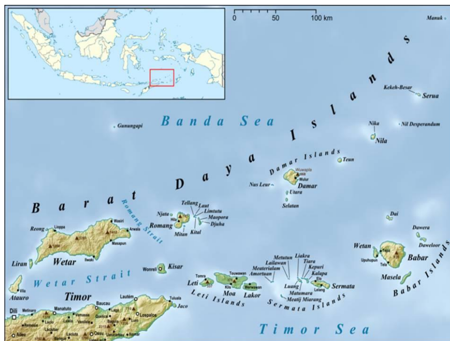
Figure 1. South-west Maluku regency islands located in the eastern Indonesia

We collected other information from fishers by conducting semi-structured interviews and focus discussion groups. Semi-structured interviews with closed and open questions put to fishers in face-to-face were conducted from April to June 2017. This assessment allows familiarisation with fishing methods, fishing grounds, concerns as well as local culture. We also randomly sampled the fishers from coastal villages based on the gear used and age of fisher. In total, 40 fishers were interviewed. Fishers were guided with books of fish to identify the local names of fish they caught. Personal interviews with fishers can gather large amounts of information regarding fishing practices [16]. The questionnaire was grouped in four sections: personal information including experience and property; knowledge of activities changes at the surrounding coastal areas, efforts and catch currently and in the past.