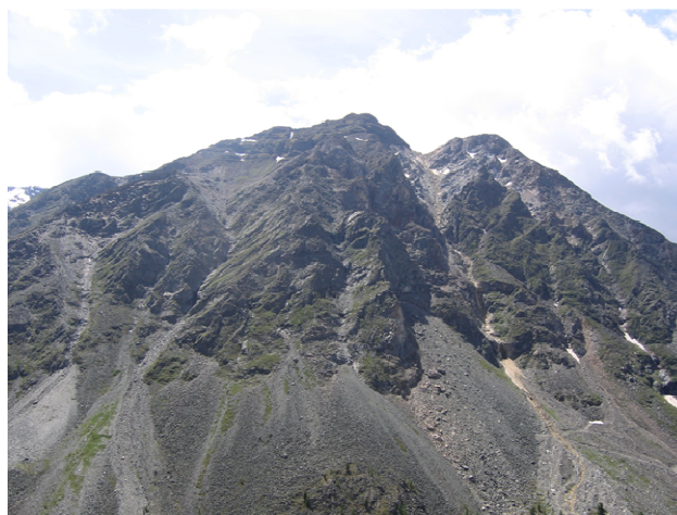
Figure 1. Ostraya Mountain, the view from the east side

The relief is similar to that in the Alps. The slopes of Ostraya Mountain in its upper and middle parts are cliffy and steep; in its lower parts they are recovered by colluvial talus and pro-luvial apron (Figure 1).