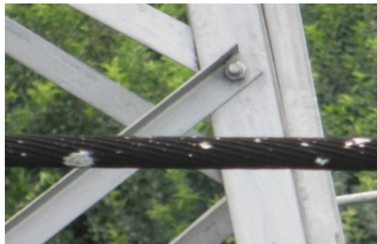
Fig.1. Discharge traces of wind deflection fault on the East -III- line

Historical data shows other incidences of wind damage to 500kV transmission towers in Jiangsu; for example, the collapse of several 500 kV towers in the Ren-Shang- 5237-line, which is an important line for the area's West-to-East transmission channel. This accident caused 10 transmission towers to collapse in a row, causing power failure across a very large area[1].