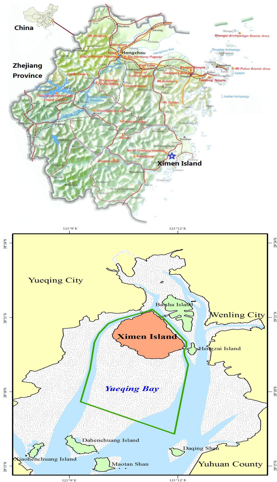
Figure 1. The location of Ximen Island Marine Specially Protected Areas.