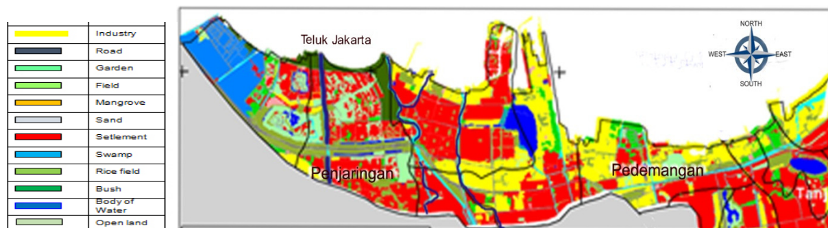
Figure 2. Spatial Planning of Northern Jakarta City