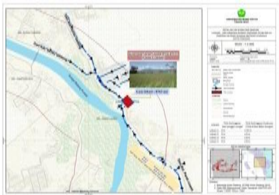
Figure 2. Map of routes for evacuation and Shelter Surau Gadang