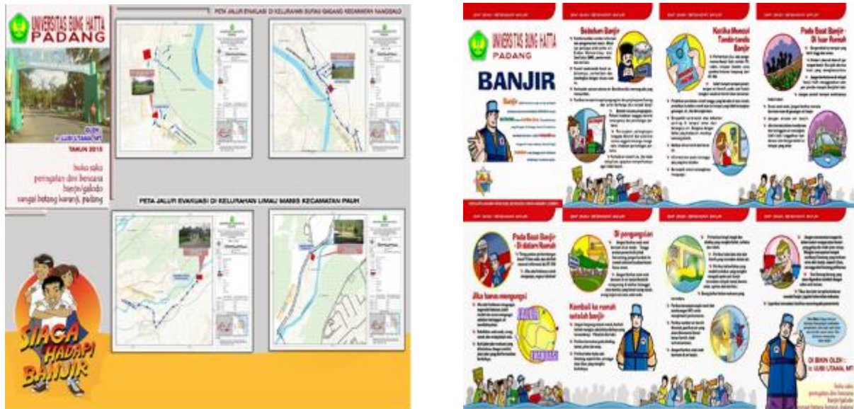
Figure 4. Pocket book: Ready to accept floods