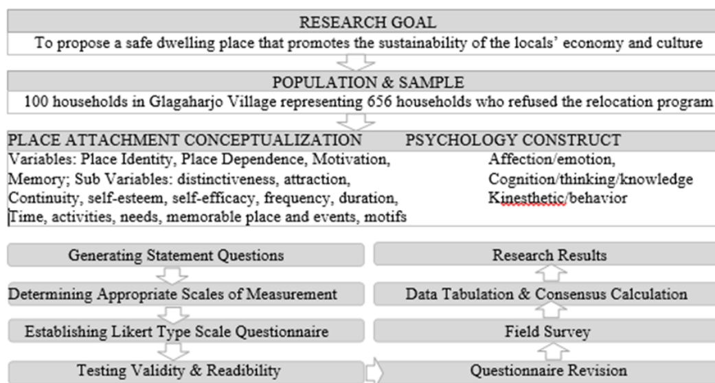
Figure 2. The research framework based on questionnaire survey method

Considering the limited time given, the sample unit is determined 100 households from 656 households in Glagaharjo Village. The sampling unit is purposive-type towards which criteria of selection must be primarily determined [29]. Related to this, respondents must have settled in the understudy areas for at least ten years. It was based on assumption that at least within those years, their emotional bond to the dwelling place had been strongly developed. Involving ten surveyors, the questionnaire considerably needed 30 minutes of time for response and each response must be filled in on-site. Figure 1 shows the location of the village which is within 15 kilometres from the volcano's caldera and the interview process with the respondents.