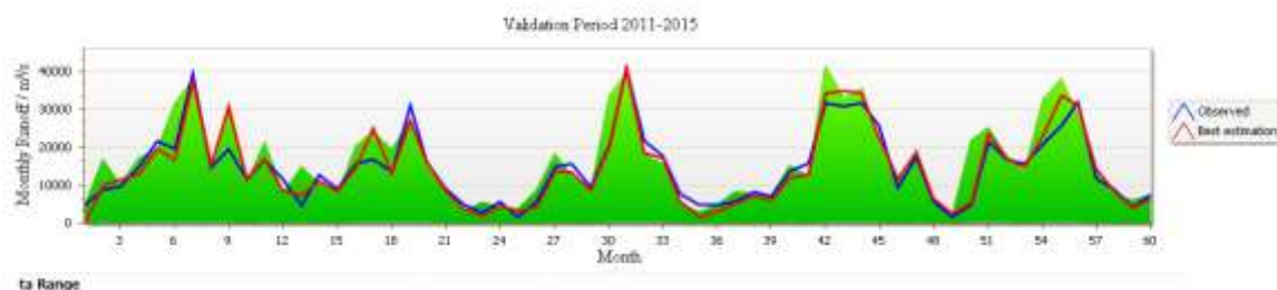
Figure 3. Solutions of Validation Period 2011-2015.