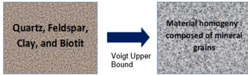
Figure 1. Effective medium theory simple illustration using Voigt upper bound.

The empirical calculation to determine elastic properties is the P-wave velocity, S-wave velocity, Bulk Modulus and Shear Modulus. P-wave velocity ( V_p ) and S-wave velocity ( V_s ) is calculated as follows [6]: