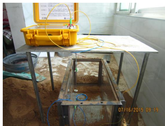
Figure 1. Sensor placement.

2.2.3. Pressure gauge placement. After the last layer of soil compaction, decorate the pressure gauge in the surface layer of soil, pressure gauge placed on the surface of the jack, the pressure gauge is used for monitoring the load values, the test process is shown in figure 1.