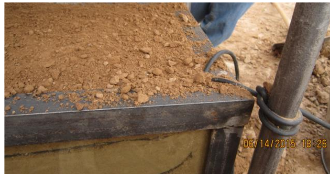
Figure 2. Bound condition.