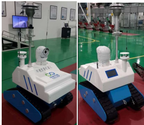
(a) lateral view