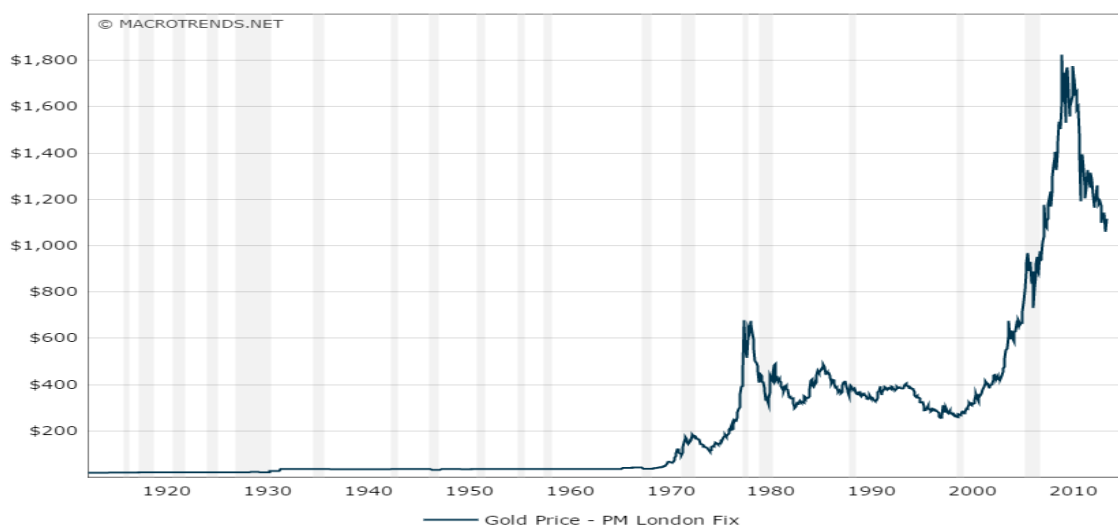
Fig. 2 Long-term graph of gold price in current prices at London fixing.

It is clearly seen from the given graph that the beginning of gold value intensive growth was observed around 1971, when gold guarantee of dollar was suspended. The growth spurted after 1976, when US dollar forfeited gold guarantee completely as a result of transition to Jamaican currency system assuming floating exchange rates. Gold volatility immediately reached unprecedented scale for the first time after 1971.