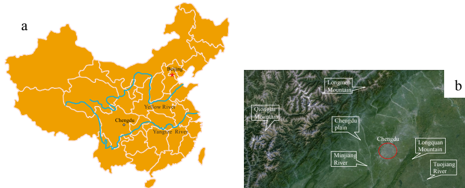
Figure 1. The location and topography of Chengdu: (a) Schematic map of the city location. (b) A snapshot of the topography at the Chengdu plain.

urbanization of Chengdu moving forward, the water security issues of this city could become more prominent.