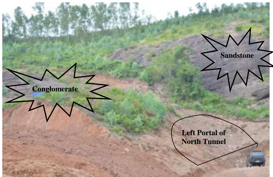
Figure 2. Geological structure around the Left Portal of the North Tunnel.

In addition, according to the results of topographical survey, intact rock in study area is tectonic system of grade II and is divided into river delta and hilly regions (Figure 2).