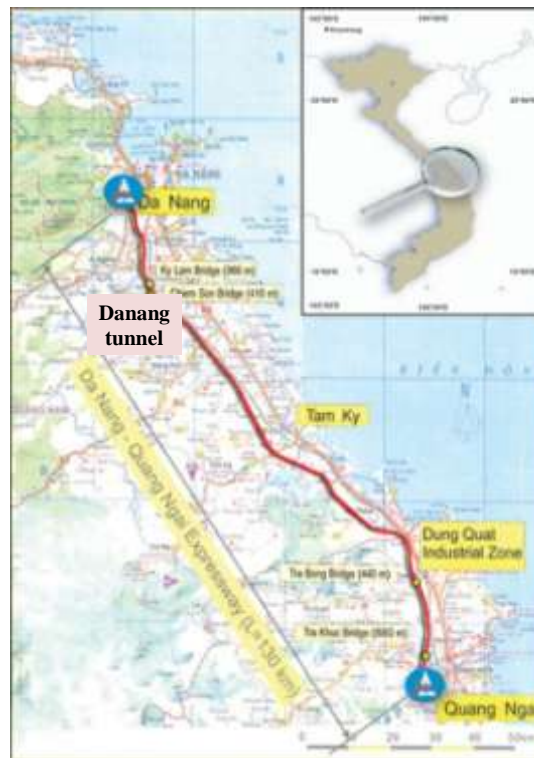
Figure 1. Location of Da Nang - Quang Ngai Expressway [7].

- Geological condition of Left Portal: A layer of extremely weathered rock is found over the bedrock with different thickness of from 4 m to 0.65m. It is residual soil (sand with gravel, reddish brown, medium dense). Conglomerate and sandstone alternate below, the proportion of conglomerate and sandstone is 4:1. Particles of conglomerate is rounded and size of 2 to 20mm, fresh to lightly weathered condition. Permeability of the fracture zone is quite small (nearly 0.5mm/min with the pressure 1 kG/cm 2 ), compression strength of lightly weathered rock is high, approximately 50MPa in average [2].