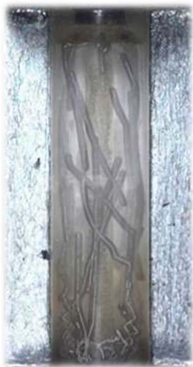
Figure 2. Stroboscopic image of pellet movement in annulus space.

are gaps between pellets within a row, as well as between rows, even if the number of pellets is optimal. Therefore, the number of pellets can be defined by the following formula: