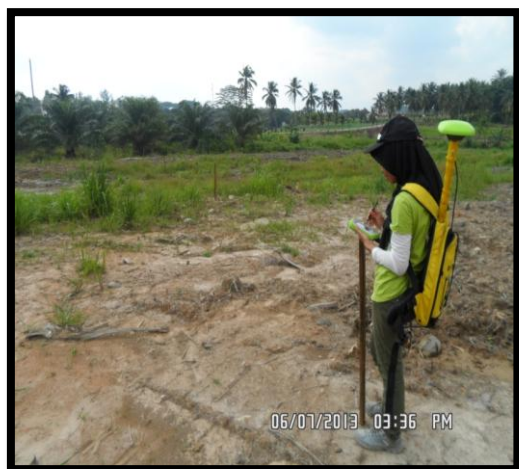
Figure 1. Survey process to the target planting point by using JAVAD Victor.

After each coordinates of the planting point was identified in ArcGIS software, it was then exported to JAVAD Victor for navigating to a certain planting point. Once the target point has been determined, the survey process was carried out to specify the coordinates of the new point and the wooden spikes were staked out onto the ground to mark out the surveyed point. The distance difference between the surveyed points and designed points were then computed by using CoGo tab (Direct Transverse) in Tracy software that gave the readings of horizontal, vertical and also the slant distance between both coordinates.