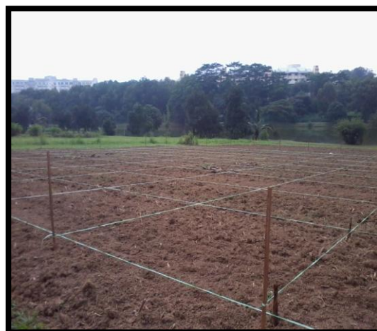
Figure 2. Wooden spikes that were staked out onto the ground to mark the surveyed points.