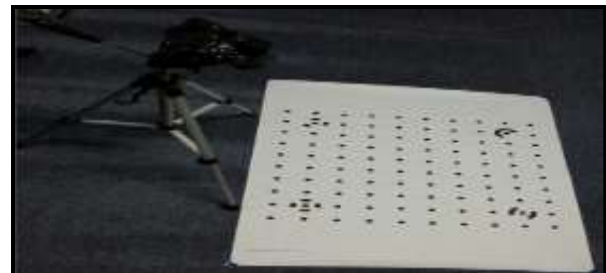
Figure 2. Calibration of Sony DSC F828 camera.

In this study, Sony DSC F828 digital camera was employed to capture the images of test points. As a routine procedure, the camera should be calibrated before can be used for 3D measurement purposes. Figure 2 has shown the calibration procedure carried out for digital camera Sony DSC F828 and the processing of the calibration parameters was made with the aid of Photomodeler V5.0 software. To evaluate the accuracy of 3D coordinates of test points whether good enough to be considered as true value, several scale bars were positioned at the measurement field. One of the scale bar with red ellipse as depicted in figure 1 is used to investigate the accuracy of 3D test points yielded from photogrammetry technique.