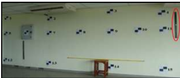
Figure 1. Test points established at calibration field.

In order to investigate the significant of self-calibration to improve the accuracy of TLS data, photogrammetry technique was utilised to establish fifteen test points (figure 1). As mentioned by Luhmann et al. [1], industrial or close range photogrammetry can provide less than millimeter accuracy, which has justified this measurement technique to be selected for determination of true values for those test points.