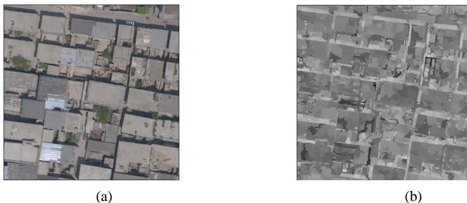
Figure 1. QuickBird image and its corresponding PRI image

For example, Figure 1 showed one QuickBird high resolution image (a) and its Pixel Rectangle Index image (b), from them we can see Pixel Rectangle Index effectively reflects the rectangle degree of object that the pixel belongs to. Because large spectral heterogeneity, (b) is not complete enough. Pixels within the same target have similar pixel rectangle index. There is a large difference between object internal and edge. We can see obvious edge in pixel rectangle index image.