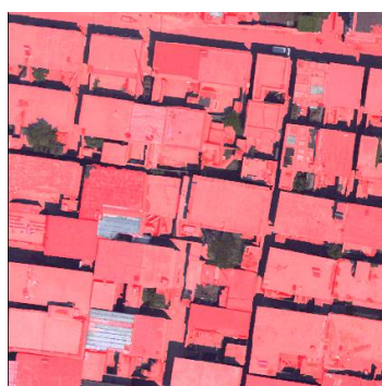
Figure 5. buliding extraction results

In this paper, based on object-based idea and segmented results former, we will extract buildings by SVM which will use the object spectral characteristic. Here we give the extract result which using the mean value of all bands of the objects as their spectral characteristic. Figure 5 gives extraction results. We can see that almost all buildings are extracted completely. We can also draw a conclusion that PRI reflects the shape characteristic of buildings effectively from extraction results.