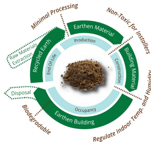
Figure 1: Cradle to cradle life cycle diagram of earth as a building material (edited from Schroeder, 2016)

The presented LCA was implemented following the ISO Standard 14040 and 14044 format and methodology [44,45], using the SimaPro software [46], the US-LCI database [47] where possible, and EcoInvent [48] processes that are globally applicable otherwise (i.e., RoW processes). Six wall assemblies are compared: 3 earthen walls (cob, rammed earth, and light straw clay) and 3 conventional walls (timber frame, insulated and uninsulated concrete block). The functional unit used is 1 square meter of a single-family housing wall, located in warm-hot climates in the US, defined as IECC climate zones 1 through 4 [49]. The system boundaries consider embodied environmental impacts from cradle to construction site, including the extraction and processing of raw materials, manufacturing, storage, and transporting to the construction site.