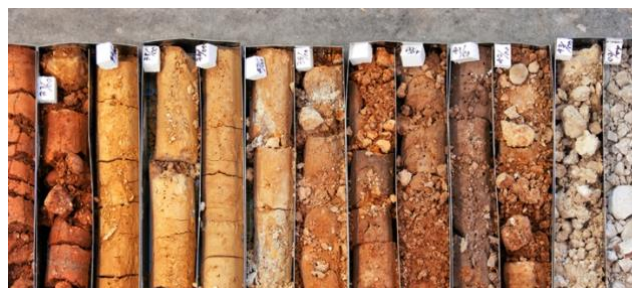
Figure 3: Homogenized soil classification, assessed in accordance with Australian Standard [64]

The challenge of material variation could be addressed by various strategies. By using wood as an example for a natural building material with large variability, we can identify the ways in which we developed both prescriptive and performance standards for timber. While the number of wood species is great, the main strategy used in timber standardization is to group species according to their structural properties and appearances, prescribing uniform grade-use data for each group. Similar to timber codes and standards, a homogenization approach grouping different species or ‘classes’ of clay materials should be developed for earthen materials to ensure adherence with format and objectives of conventional standards.