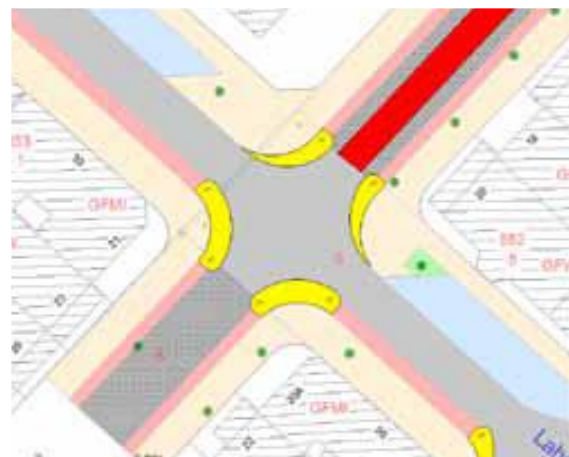
Figure 3 pavements enlargements at crossings