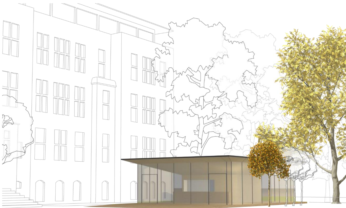
Figure 4 Situation of the new bicycle repair café in front of the university's historic main building

Situated in front of the university's historic main building (Figure 4), the historical context also had to be taken into account for the building's design. Since the neighbouring buildings are under a so-called "ensemble protection", the city's highest monument authority along with the city's design advisory