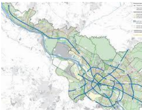
Figure 2 Network of Premium Bicycle Routes

Air pumps and e-bike charging stations will be built at all three university campuses, integrated into the covered bicycle parking facilities.