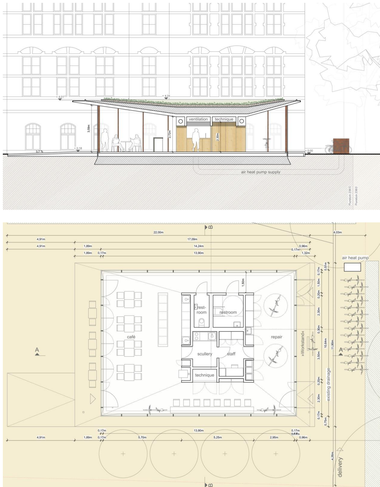
Figure 5 Section (above) and floorplan (below) showing the technical and structural core of the building, defining the usage areas