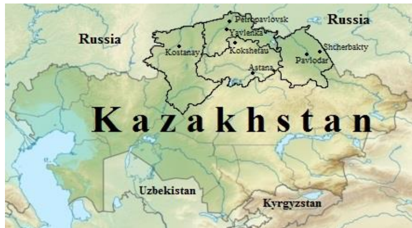
Figure 1. The Territory of Northern Kazakhstan.