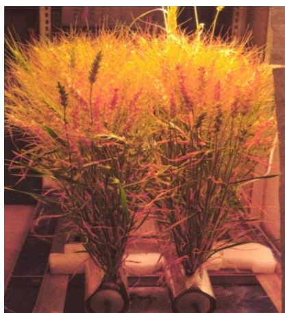
Figure 2. Module with wheat plants.