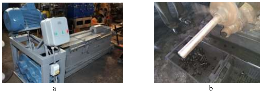
Figure 1. a) press BT.ShP 50.0; b) briquetting process.

The mixture was briquetted on screw auger installation with a BT.ShP 50.0 press (figure 1).