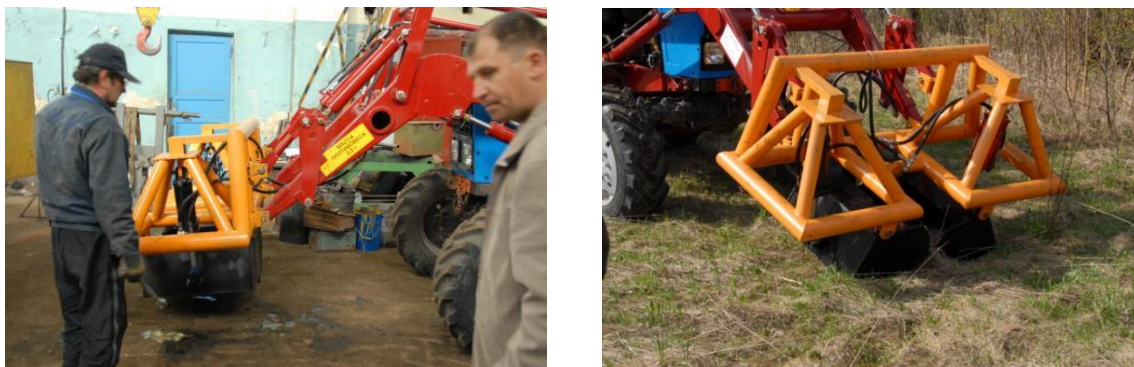
Figure 3. Aggregation device for transplanting small trees with a tractor.

During the tests, it was also found that due to the small angle of entry of the buckets into the soil and their shape, as well as the low pressure capacity of the device, its use is ineffective, therefore, the solutions proposed in the article will be very significant.