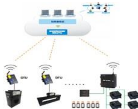
Figure 1 Map of system schematic

(1) The system is composed of intelligent monitoring terminal, wireless transmission equipment and cloud transmission equipment.