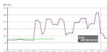
Figure 3. Big data analysis diagram

(5) Big data analysis function. Intelligent electric power safety service system also provides alarm record, historical trend, report analysis and other functions. Platform regular weekly statistics current electricity data and generate test report. It can login platform browse according to the selection, view the history of the single parameter back to address curve line (such as temperature, leakage current, etc.). By contrast analysis of the operation of the road which a few important load, the client can see the day, month and year of overall power load and the peak valley of day power consumption. They also can analysis and provide exception alarm circuit alarm reason.