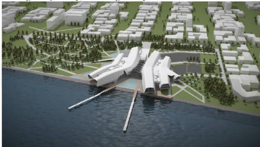
Figure 2 Building Standard Modular System

This paper takes Binhe New Home Public Rental Housing Project as an example, applying BIM technology from standard design to management. The building standard modular system is adopted to realize the economical and efficient prefabrication of components, which is convenient for assembly assembly and precise connection with the traditional operation parts. At the same time, it can standardize the specifications of related supporting building materials and parts, and realize the integration of decoration. The standardized and modular design mode realizes the separation of the residential space support system and the filling system, forming an open pattern. It has achieved variable spatial and high adaptability, achieving "100-year residence" and full customer coverage.