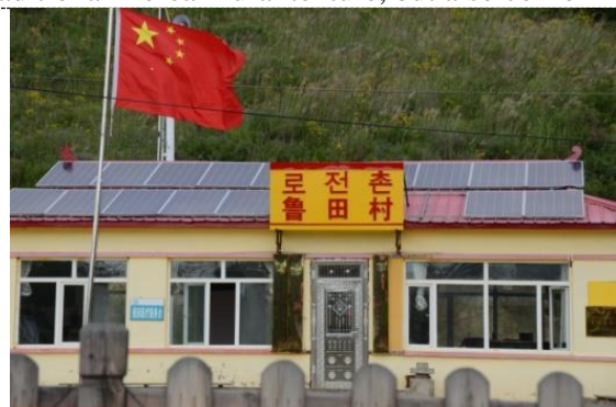
Figure 3. The village of Jing Xin town

Jing Xin Town is located in the unique Korean traditional area with beautiful rural architectural construction. The layout and main style of the buildings are inclined to the Korean style, and are applied to all aspects. Whether it is colour, style or façade, use local elements as much as possible. In addition to retaining the charm of the town itself, it has transformed from the traditional Korean style of the enclosed and sloping roof to the modern style, with Han, Chao, Mongolian, Manchu, Russian and other ethnic characteristics as the carrier, reflecting the local tradition of multi-integration. Culture forms a regional cultural tourism destination and can enhance the local people’s sense of belonging. The application of the sense of hierarchy makes the town of Jing Xin not only conform to the traditional Korean rural texture, but also conform to the development trend of architectural style.