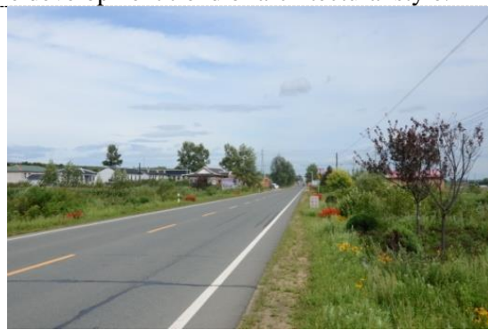
Figure 4. Jing Xin Town