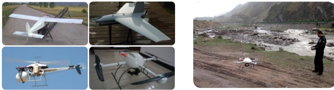
Figure 1 Map of collection data by UAV