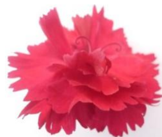
Figure 5. Progeny D3.