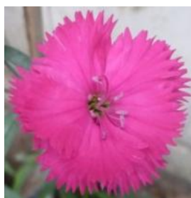
Figure 7. Progeny D5.