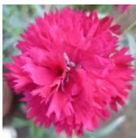
Figure 3. Progeny D1.

The plant height range of genotype D was between 36.20 cm (D6) – 78.05 cm (D1). The height of D1 genotype exceeds the height of the female parent, namely ‘Liberty’ with 73.33 cm height. Genotype D6 height was almost as high as the male parent, namely SK 11-1 of 31.73 cm. Although population D consisted of only six genotypes, the plant height characters were very diverse. The stem diameter varied from 0.25 cm until 0.41 cm. The branches number of population D ranged from 2.60 – 14.69. Genotype D6 had long (9.01 cm) and wide leaves (1.51 cm), while the genotype D3 had long (10.18 cm) and narrow leaves (1.21 cm) (Table 3).