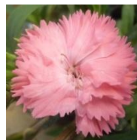
Figure 8. Progeny D6.