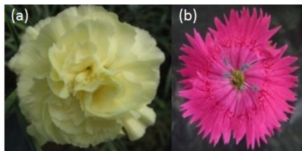
Figure 1. (a) Seed pod parent ( Dianthus caryophyllus 'Liberty') dan (b) Pollen parent ( Dianthus chinensis 'SK 11-1').

Six interspecific carnation hybrids obtained from crossing of D. caryophyllus 'Liberty' x D. chinensis 'SK 11-1' in 2013 in Indonesian Ornamental Crops Research Institute (IOCRI) were used in this study excluding their parents (Figure 1 ). The six clones were maintained by vegetative propagation. During the experimental period, all the plants were cultivated in polybag in IOCRI's screen house 1100 m asl. The experiment was conducted with an experimental method using randomized block design (RBD) with four replications from November 2014 – July 2015. The crossing method : before pollination, flower of the female parent is castrated by cutting the petals and stamens and then covered with oil paper to avoid pollination from unwanted pollen. Pollination is carried out in the morning against female flowers that already have receptive pistils, which are marked by the styles starting to curve outward and the papillae appeared fuzzy. Pollination is done by smearing the pistil with mature pollen. Hybridization is succesfull if two weeks after the crossing, the ovary are enlarged. Fruit from the cross is harvested about four weeks after pollination.