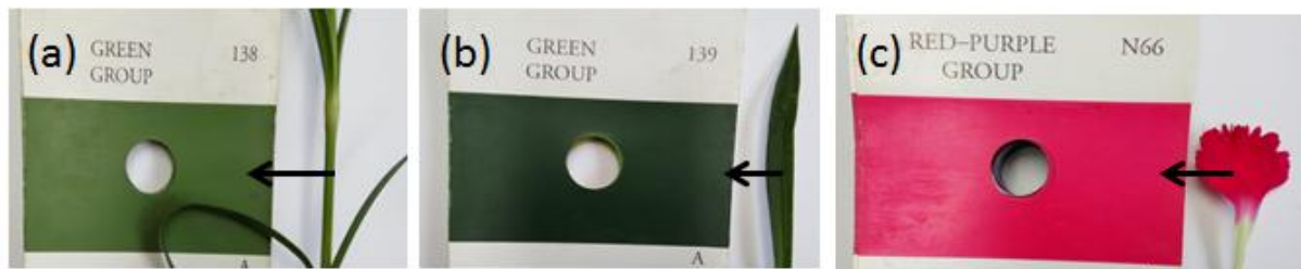
Figure 2. Observation of the color of (a) stems, (b) leaves and (c) flowers using the Royal Horticultural Society Color Chart.