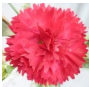
Figure 6. Progeny D4.