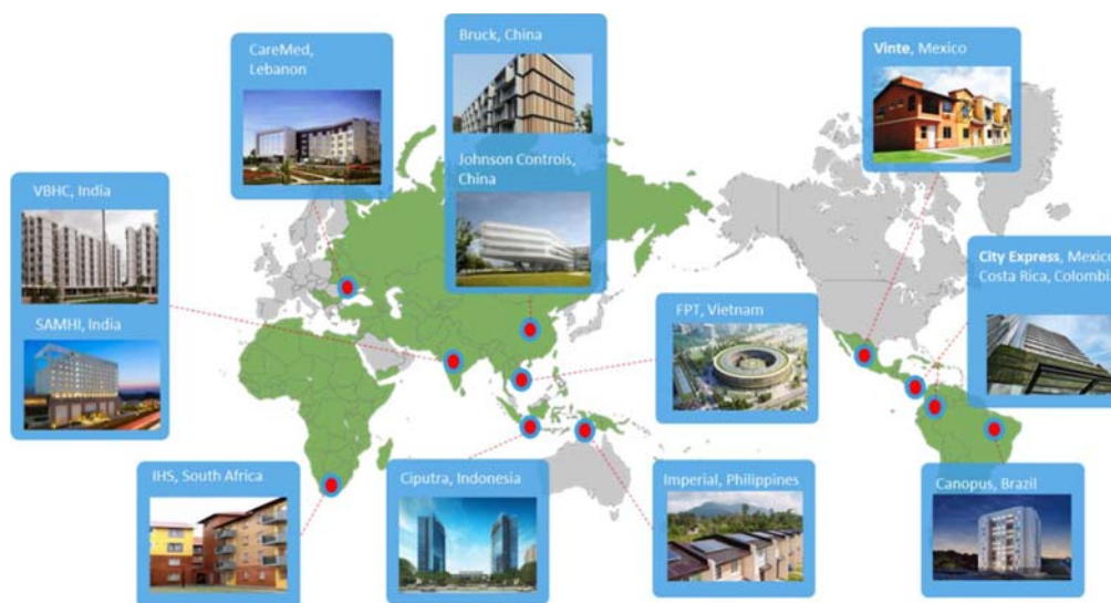
Figure 1. Examples of EDGE certified projects, with countries where EDGE certification is available marked in green.

Using a free access online application ( www.edgebuildings.com ) incorporating a locally contextualised simulation engine, EDGE empowers the discovery of technical solutions at the early design stage to reduce operational expenses and environmental impact. Based on the user's basic information inputs and then selection of green measures, EDGE provides projected operational savings and reduced carbon emissions within minutes. This overall picture of the financial and environmental performance of a building helps to articulate a compelling business case for building green.