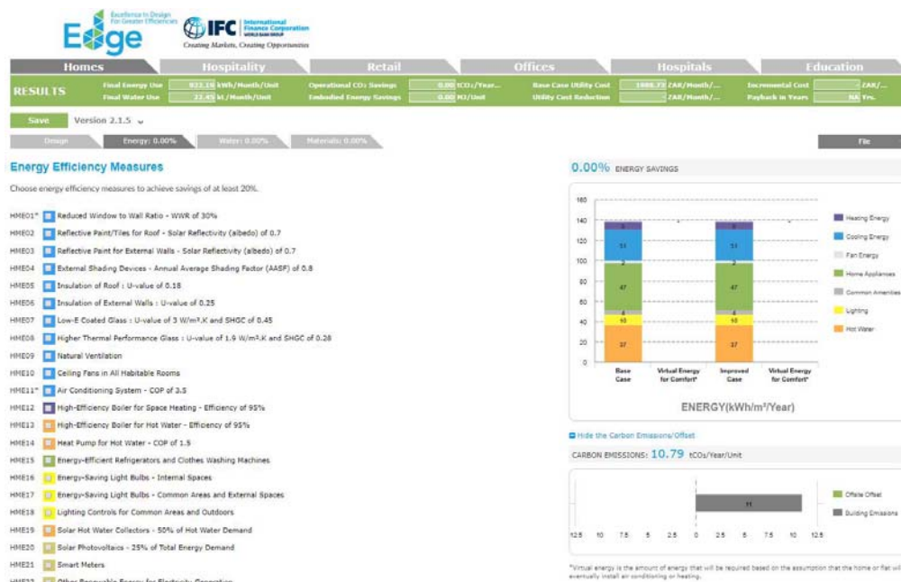
Figure 2. Screenshot of EDGE online application showing the energy section for homes

The suite of EDGE tools includes building type specific design simulation engines connected to user guides providing both technical explanations and procedural guidance on certification.