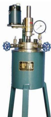
Figure 1. CJF1 stainless steel high temperature and pressure reactor