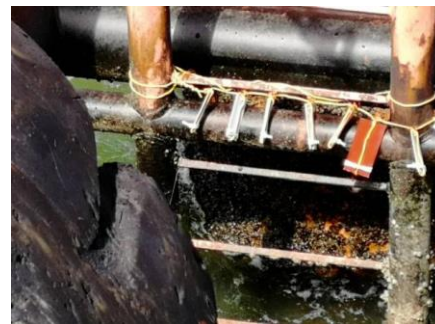
Figure 8. Test suspension sample suspension in early April 2019