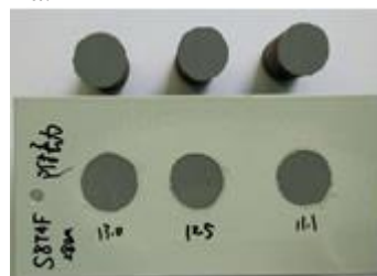
Figure 5. The adhesion of the paint film is tested by the pull-open method.

Both tests have shown that graphene anti-corrosion coatings have excellent adhesion and can accommodate a variety of thick and thin coating thickness requirements. This is due to the excellent electrical conductivity of the graphene and the large specific surface area, which can greatly reduce the amount of zinc powder in the primer, which is more conducive to improving the adhesion, mechanical properties and compactness of the primer coating.