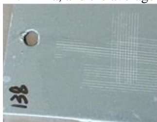
Figure 4. The adhesion of the modified graphene thermal and anticorrosive coating is tested by the hundred-grid method.

The yellow graphene anticorrosive coating (280 \mu\text{m} ) is tested according to GB/T 5210-2006 "Painting and varnish pull-off adhesion test". The experimental results are shown in the Fig.5. The results of the pull-open test are shown as adhesives. The cementation in the test column is destroyed, and the surface of the coating is not damaged. The final results of the pull-opening method were 13.0 MPa, 12.5 MPa, 11.1 MPa, and the average value was 12.2 MPa.