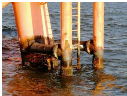
Figure 7. Sample Suspension Position