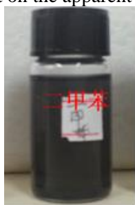
Figure 1. Dispersion state of modified graphene in xylene

As shown in Fig. 1, the graphene slurry after dispersion can be observed to have uniform dispersion of graphene in a solvent, and it is proved that the modified graphene has good dispersibility in xylene. At the same time, the functionalized graphene was analyzed by SEM. It can be seen in Fig. 2 that the functionalized graphene still has a distinct multi-layered sheet structure, indicating that the modification has little effect on the apparent state of graphene.