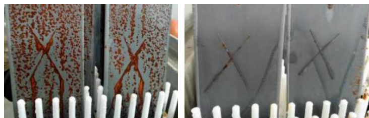
Figure 3. Comparison of salt spray test between ordinary zinc-rich anticorrosive coating (left) and modified graphene thermal anticorrosive coating (right)

The functionalized graphene thermal and anticorrosive coatings were comprehensively investigated for their corrosion resistance and compared with ordinary zinc-rich anticorrosive coatings. The test procedure was carried out in accordance with the requirements of Standard GB/T 1771-2007 "Determination of Neutral Salt Spray for Paints and Varnishes". The experiment uses the YW/R-150 salt spray corrosion test box produced by Tianjin Surui Technology Development Co., Ltd., and the temperature inside the box is always maintained at 35 °C. The sample was a carbon steel sheet of Sa2.5 grade after sand blasting, and the size was 150 mm×70 mm×1.5 mm. After the coating was dried, the surface was cross-knife. The modified graphene thermal anti-corrosion coating was compared with the traditional anti-corrosion coating after the 1500 h salt spray test. There is no obvious corrosion phenomenon on the scratch surface of the graphene anticorrosive paint sample, but the surface of the ordinary zinc-rich anticorrosive paint has a large area of corrosion. This indicates that the graphene anticorrosive coating has excellent salt spray resistance. The test results are shown in Fig. 3.